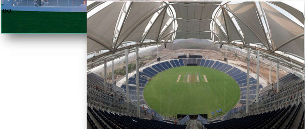
Sahara Stadium – Pune, India – Cricket Stadium for 48,000 Spectators