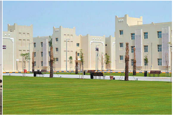
Labour City, Mesaimmer, Qatar