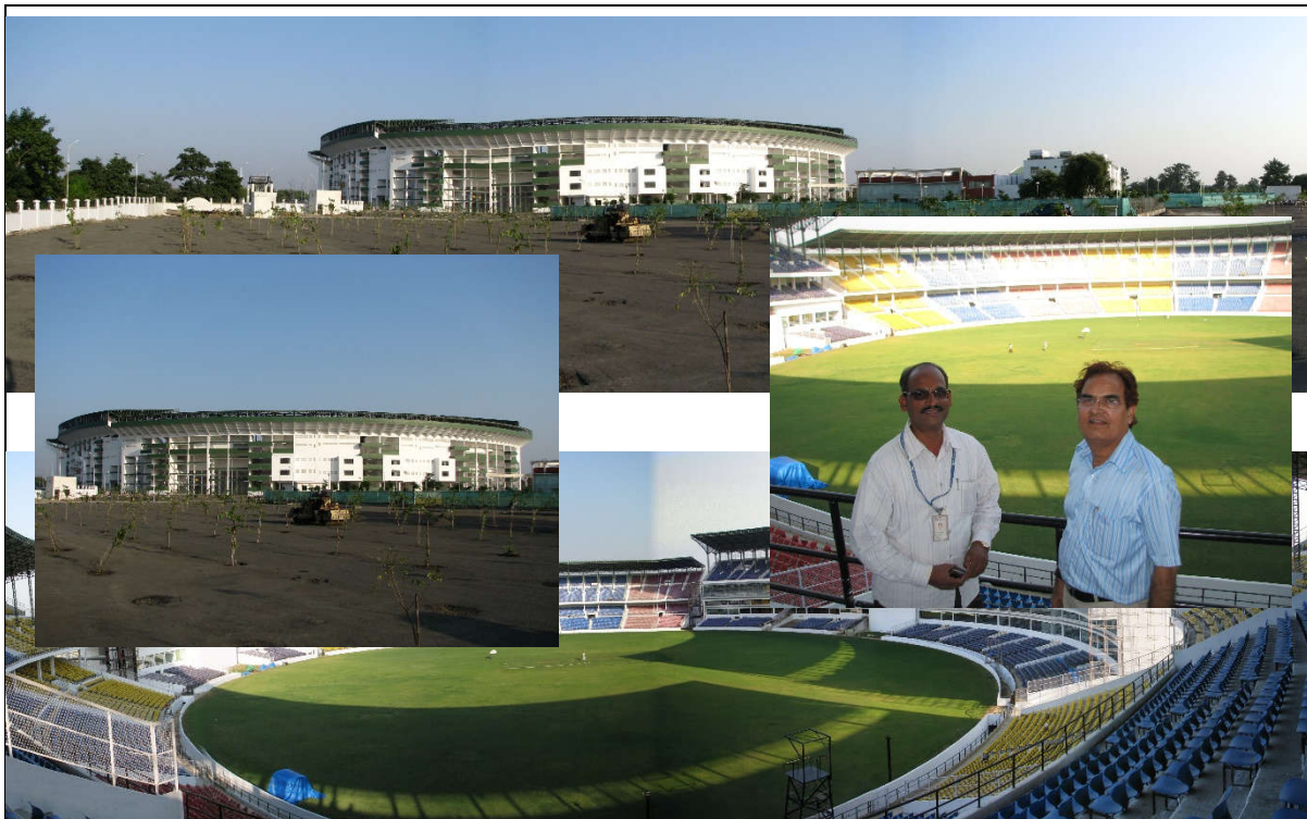
VCA Cricket Stadium, Nagpur, India – Cricket Stadium for 48,000 Spectators