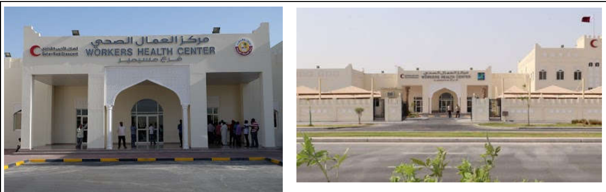
Qatar Red Crescent Workers Health Center – Mesaimeer, Qatar